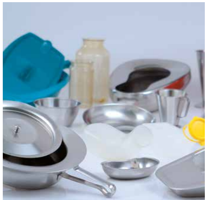
Amigo can be used for the cleaning and disinfecting of human waste receptacles in a wide range of shapes and sizes.

Amigo is a top-loaded unit, designed for counter-height access. The front is lower than the rear, creating wider access when the top lid is open, thus making it easy to load, empty and monitor. This also makes the emptying of cleaning buckets and other large receptacles easier when using Amigo as a slop basin.