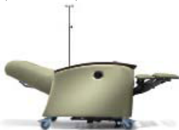
4-sided Brake Access

During the path of Progressive Mobility , the Symmetry Plus Treatment Recliner promotes patient recovery. With an infinite number of recline positions and extended arm caps for safer ingress and egress, the recliner is a safe and comfortable platform for patient use.